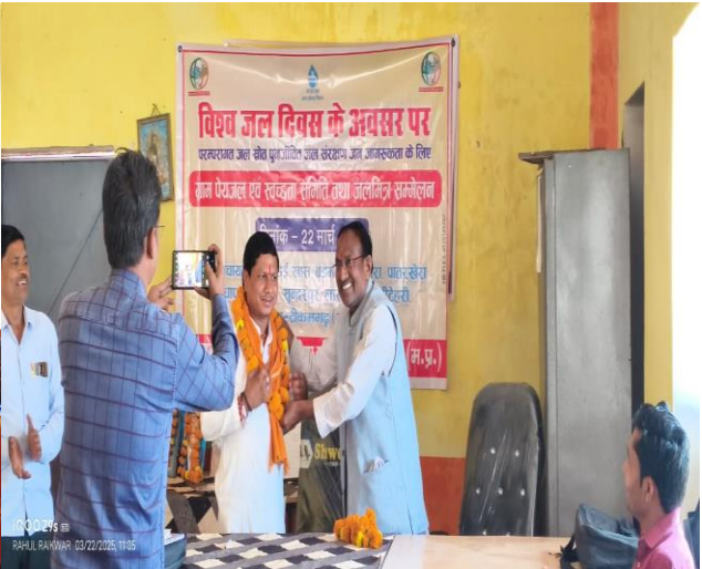
“The World Water Day program was organized at the Gram Panchayat level.”