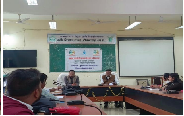
Staff Meeting and Training at Krishi Vigyan Kendra (KVK) Tikamgarh MP