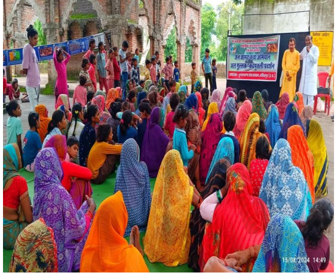
Community Awareness Program through creative Puppet Show