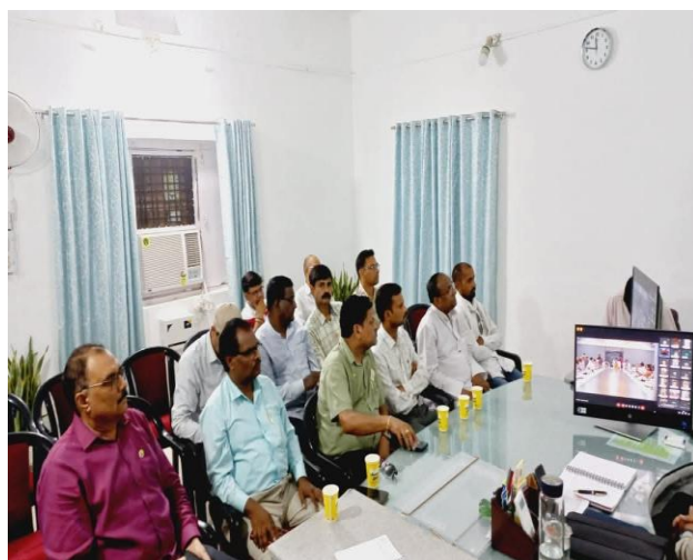
Meeting with District Forest officer at Office regarding plantation campaign