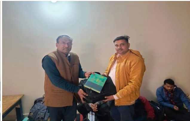
Director Meeting with Newly appointed project staff at Tikamgarh Office