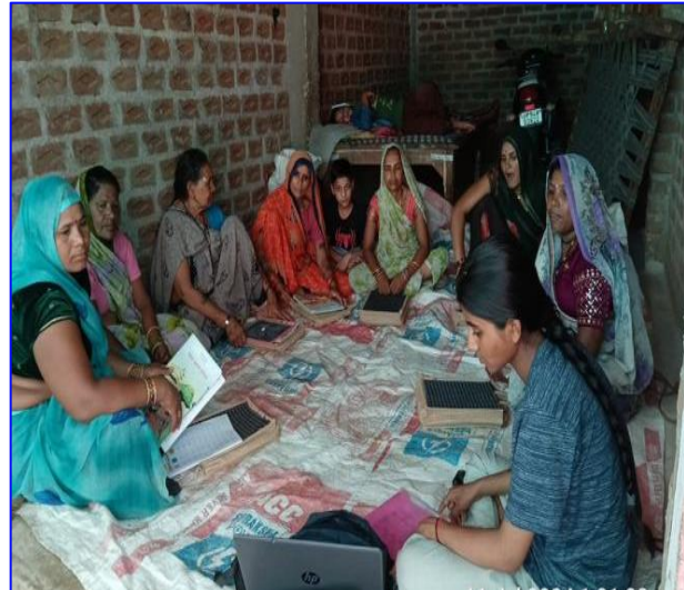
“Class Batch in Literacy Center”