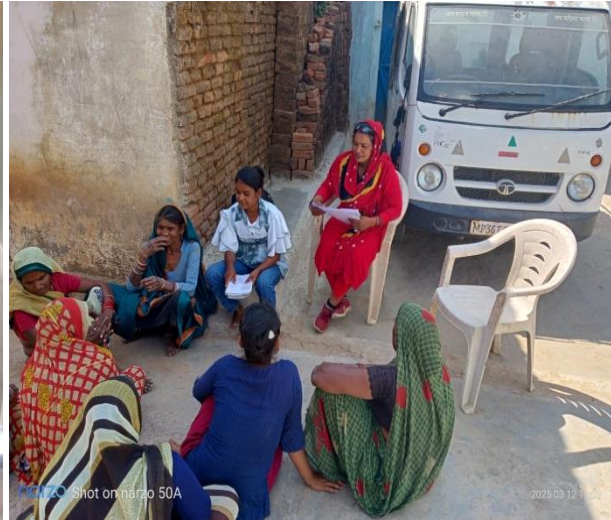
“BSS workers informed the officials about the issues related to drinking water supply.”