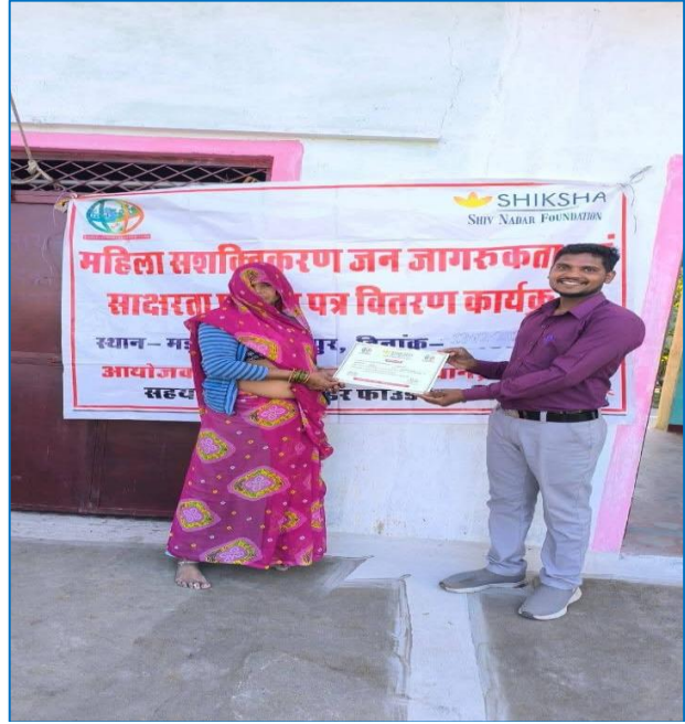
Literacy Certificate Distribution