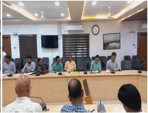
Participation as a member in the meeting of the District Ganga Committee, Lalitpur UP.