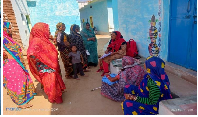
Baseline Survey Activity with Community Members