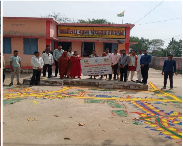
Participatory Rural Appraisal (PRA) Activity in the villages