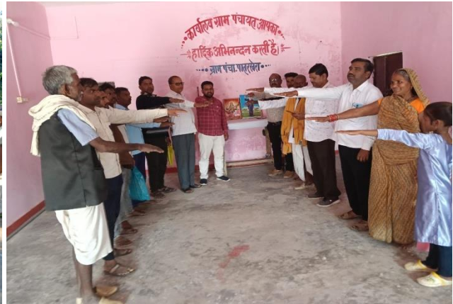
FGD & Pledge activity with community member at Gram Panchayat office