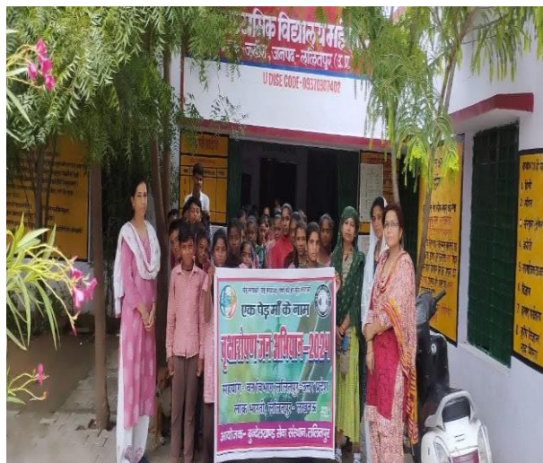
Awareness Activity with Students and Teachers at School