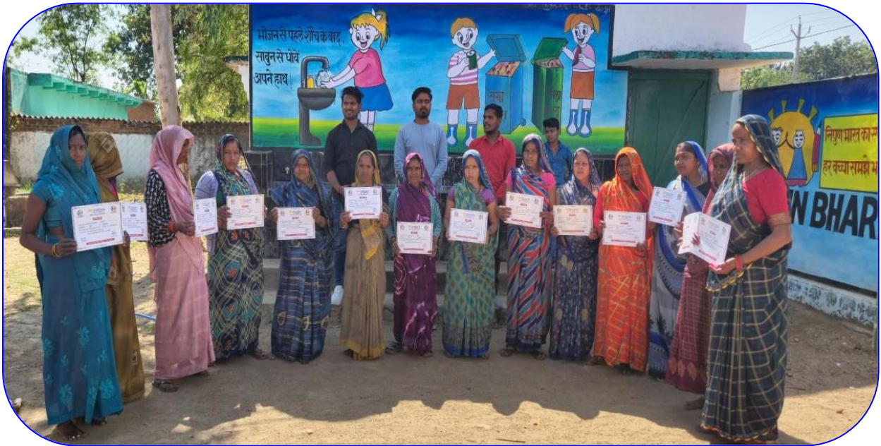
Literacy Certificate Distribution Programme