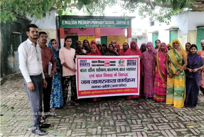
Bundelkhand Sewa Sansthan, Access To Justice 21 08 2024 13:06 25-56878, 78-78911 HQ9Q+H94, Jarvai, Maheba 284301