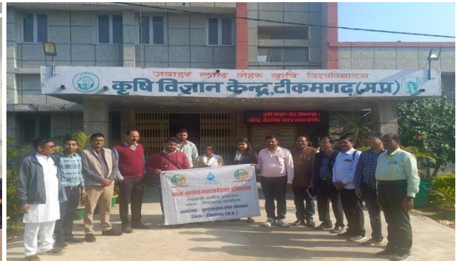
“The Participatory Rural Appraisal (PRA) and the Gram Action Plan Survey Training Program were organized at the Krishi Vigyan Kendra, Tikamgarh.”