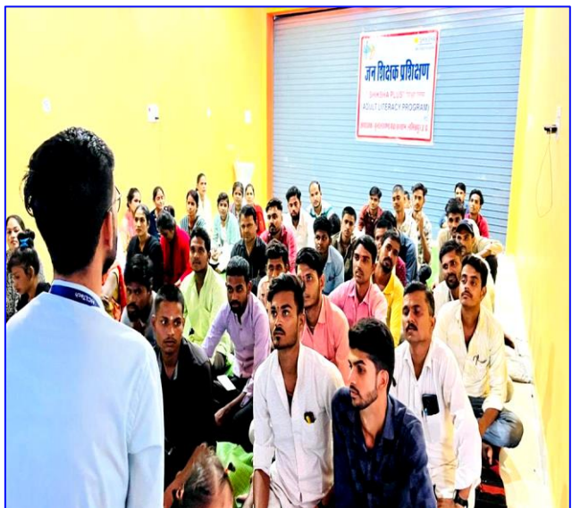
Training Workshop for Community Educators Volunteers (Jan Shikshak)